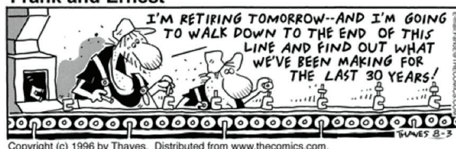
Frank and Ernest

Employees are at their best, and most engaged in their work when they believe they are playing a winnable game. A very simple premise, but yet so often overlooked by leaders. The highest standard a leader can aspire to is, "am I creating a winnable game for those I lead?" Are your folks playing to win, or playing not to lose? This is not a subtle issue. Are employees coming to work every day trying to keep their heads above water or are they focused on what matters most? Do they know the rules to the game (how to win and what success looks like) or is it cloudy and vague?