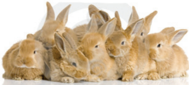
Change Task Force

The term 'change-management' itself is an oxymoron. Management is about the known (budgets, planning, problem solving, organizing, staffing, schedules, etc.) and change is about the unknown. The unknown cannot be managed. You manage what you know; you lead where you want to go. Top leaders understand that leadership is about inspiring, motivating, aligning, rewarding, recognizing and most importantly establishing a vision.